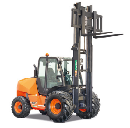
C 501 H x4 5000 kg