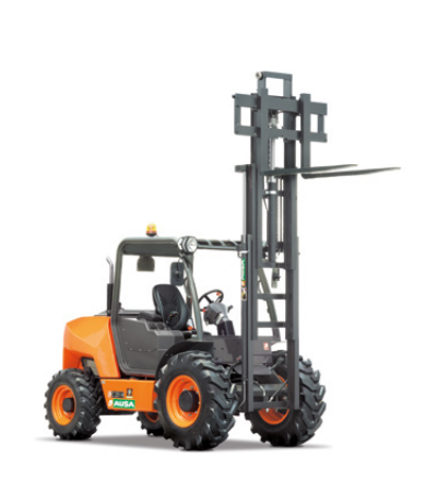
C 251 H x2/x4 2500 kg