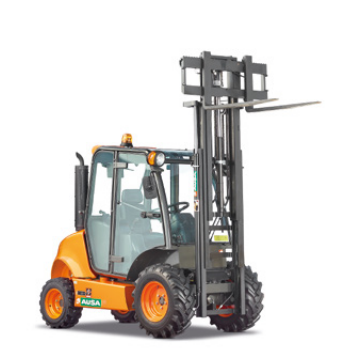
C 150 H x2/x4 1500 kg