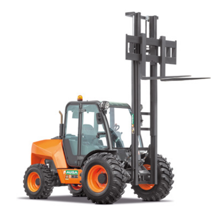
C 351H x4 3500 kg