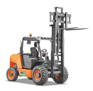
C 201 H x2/x4 2000 kg